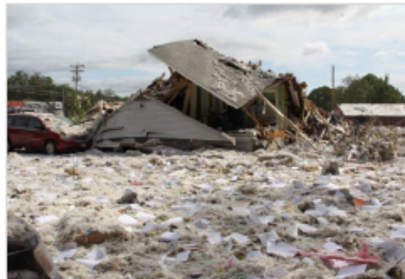
Debris field from the propane explosion described in the FFFIPP Investigation

Underwriters Laboratories (UL) and gas suppliers recommend personnel use gas detection equipment to detect natural gas or propane leaks.