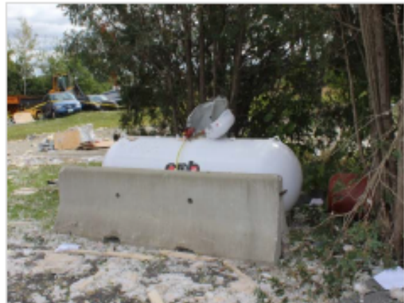
Propane tank involved in the explosion described in the FFFIPP Investigation