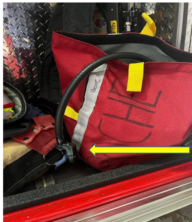
Incorrect Storage: Hose and PIN Connector are not contained within the protective bag.