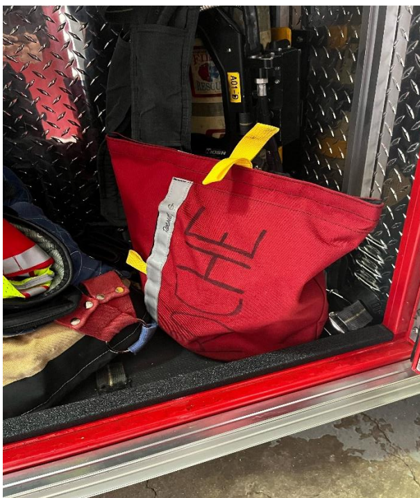
Correct Storage: Hose and PIN Connector are contained within the protective bag.

The issued SCBA face piece and regulator should be stored in a manner that protects it from becoming damaged. If you are assigned to a singular riding position for the duration of your shift, it is permissible to leave the regulator connected to the SCBA in a ready for service position. See the pictures below: